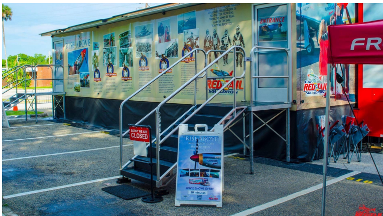
The USS Yorktown Foundation sponsored the RISE ABOVE REDTAILS: Tribute to the CAF Redtail Squadron Tuskegee Airmen