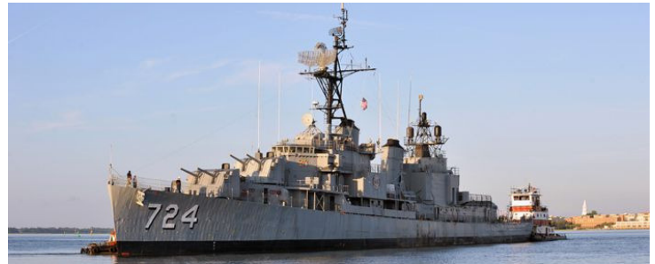
USS Laffey Battle of Okinawa flag and display case